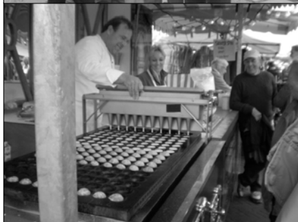
Top: Windy at Zoutelande