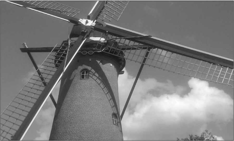
Beautifully restored and working - Thorlen Windmill