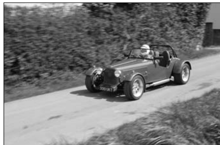
Off the start at Gurston