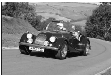
...and at Prescott - centre stage through Semi Circle

vintage Bugatti, a Morgan or two and other assorted exotics.