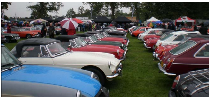
How many NG donors? MGB50 at Blenheim Palace