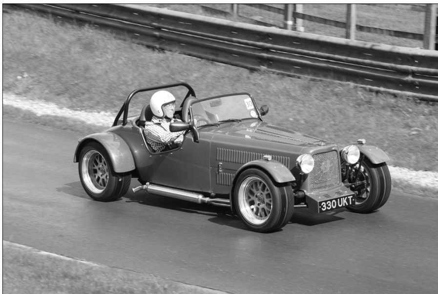
In the Wet at Prescott