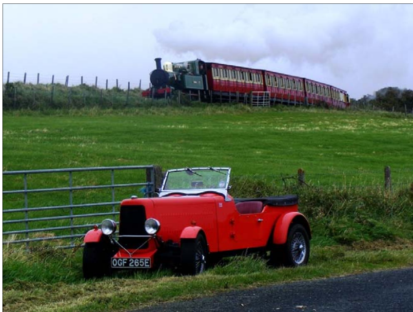
Jeremy Evans' TA and Train - see page 12