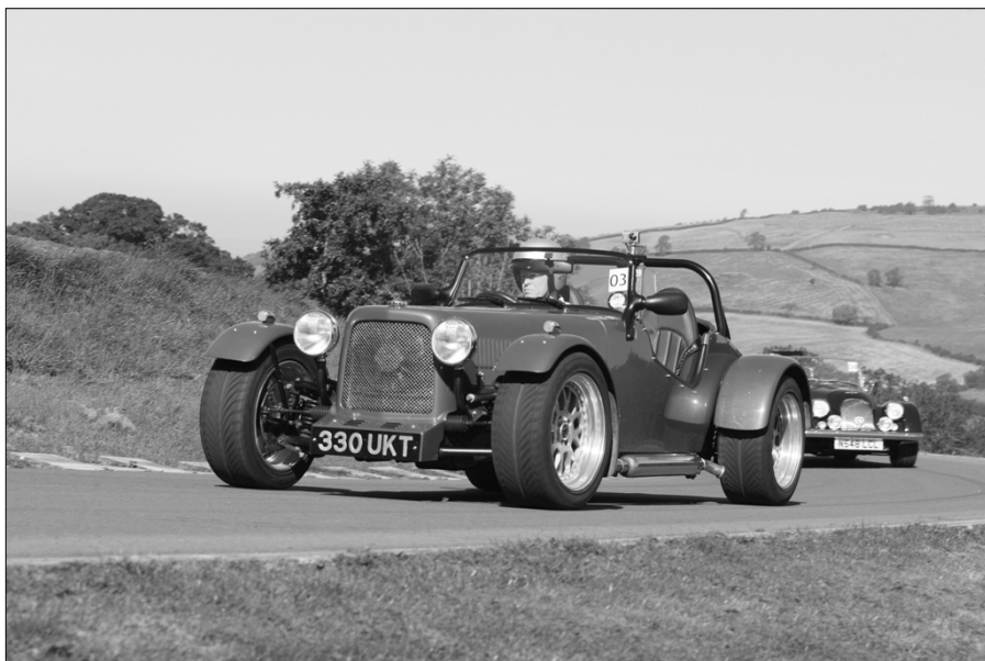
Prescott - Peter through Semi Circle (watch behind!)