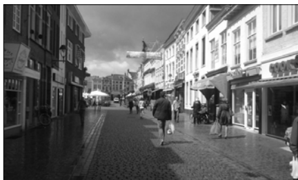
Bergen op Zoom